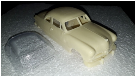
Carroceria CD77b.....35 euros