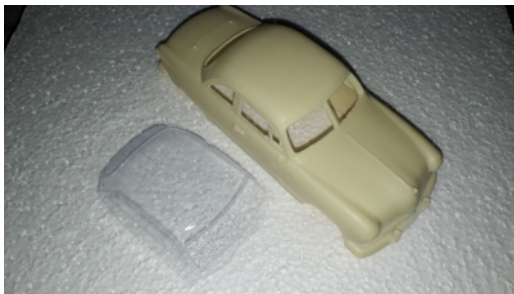
CARROCERIA CD77.....35 euros