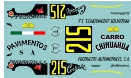
calcas CD73b.....25 euros