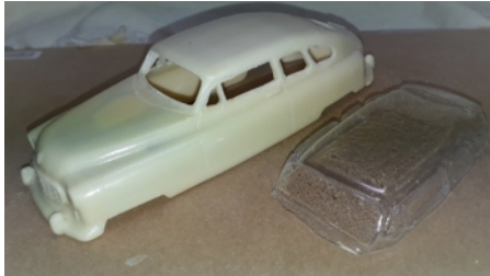
carroceria+cristales... 25 euros