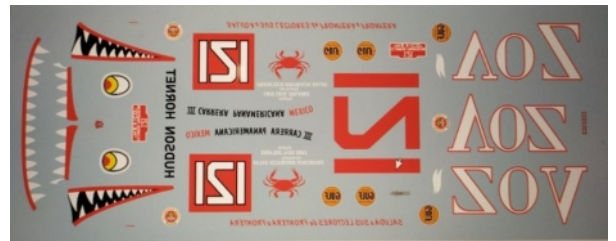
calcas CD60c.....25 euros