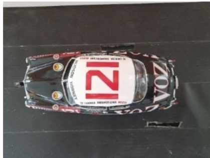
c arroceria+calcas CD60c....55 euros