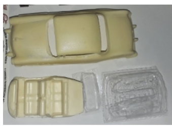
carroceria+interior CD71. 30 euros