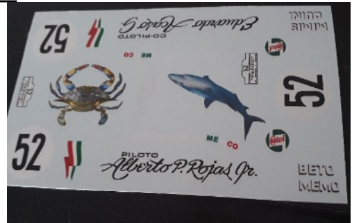
calcas CD52.....25 euros