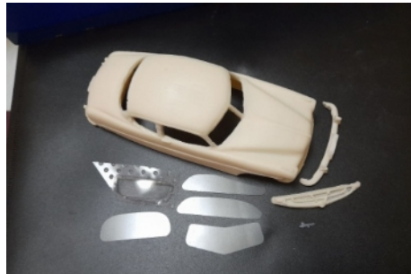
Carroceria CD60b.....30 euros