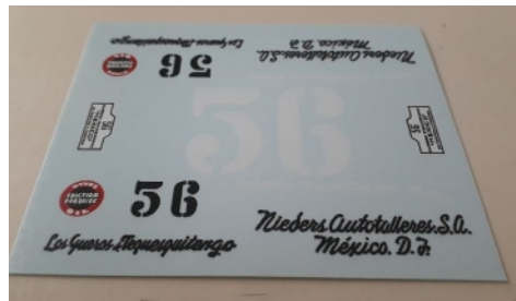
calcas CD77.....20 euros