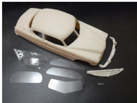
Carroceri CD60c.....30 euros