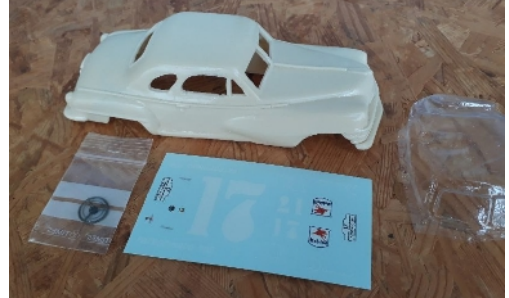
carroceria+calcas CD76b.....55 euros