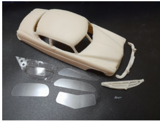
Carroceria CD60a.....30 euros