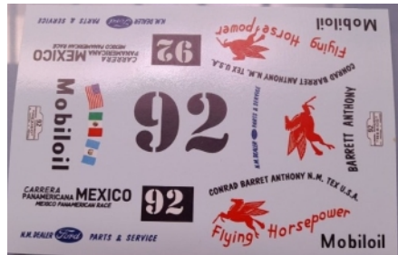
calcas CD77b.....22 euros