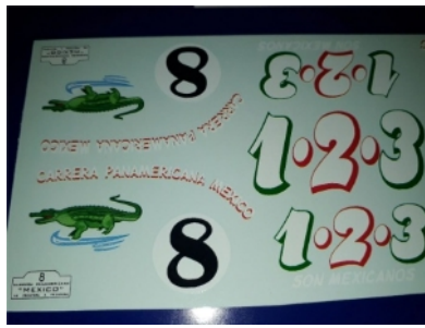
calcas CD75.....22 euros