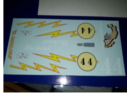
calcas CD75.....22 euros