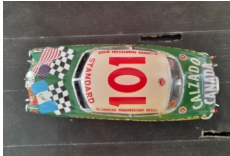
carroceria+calcas CD60b....55 euros