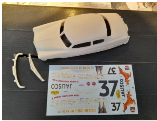
carroceria+calcas CD60a....55 euros