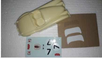
kit CD74.....65 euros.....calcas CD74.....20 euros