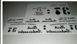
calcas CD61...18 euros