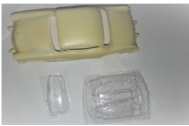
carroceria CD71.....25 euros