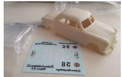
carroceria+calcas CD77.....55 euros