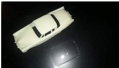
Carroceria CD73.....35 euros