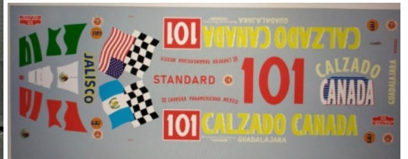
calcas CD60b.....25 euros