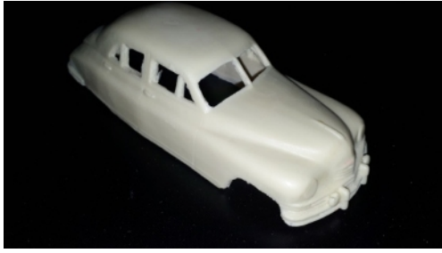
Carroceria CD75.....35 euros