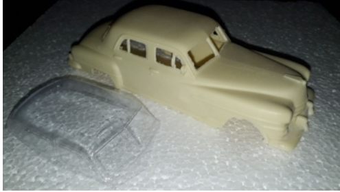
CARROCERIA CD76.....35 EUROS