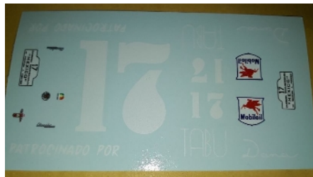
calcas CD76b.....22 euros