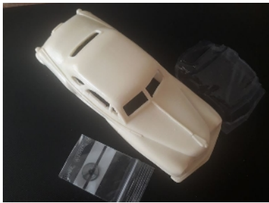
Carroceria CD76b.....35 euros