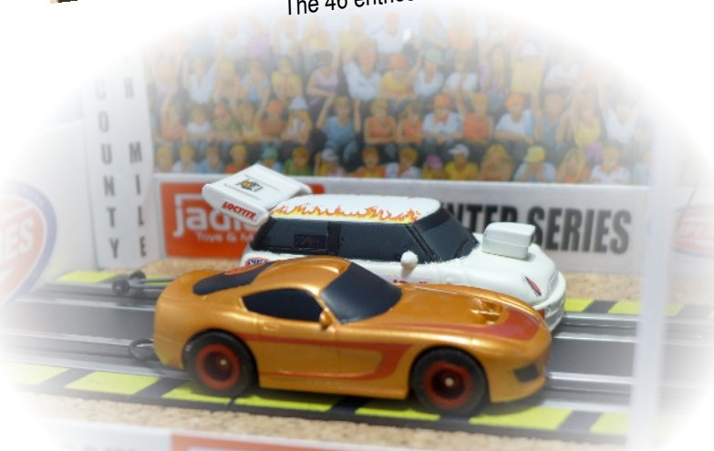
Best in Show: There were no new cars this time - although there were a few new pairs of wheels! Rebecca is waiting patiently to see what you're cooking up for next month.